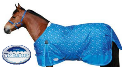
Pony Standard Neck Medium Weight $93.99