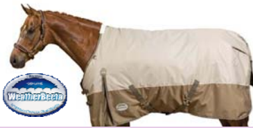
Landa Standard Neck Lite Weight $94.99