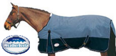
Orican Standard Neck Lite Weight $104.99