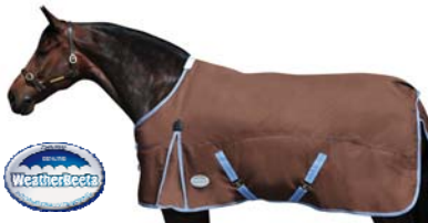
Orican Standard Neck Medium Weight $110.99