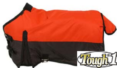
Mini Turnout Medium Weight $44.49