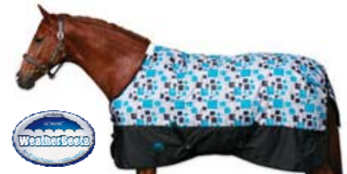
Genero Standard Neck Medium Weight $84.99