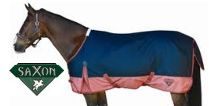
Saxon Standard Neck Heavy Weight $99.99