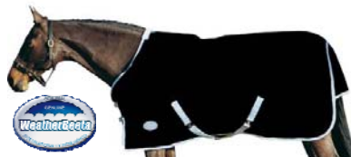
Genero Standard Neck Lite Weight $74.99